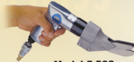
Model P-592 Pistol Grip with Aluminum Shear Head

Kett makes these powerful Fiber-Cement Shears in your choice of six pneumatic models. Select a lightweight aluminum head or rugged steel shear head in either pistol grip or straight handle versions. All Kett Pneumatic Fiber-Cement Shears give you the advantage of variable speeds and long lasting A-2 tool steel blades. They last far longer and cut cleaner than expensive carbide tipped saw blades.