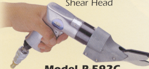
Model P-592C Pistol Grip with Contour Shear Head

Also available... Model P-593 Pistol Grip with Steel Shear Head