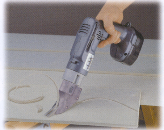
Contour cutting with 92-20C Shear Head

Each tool kit comes with a compact portable carrying case.